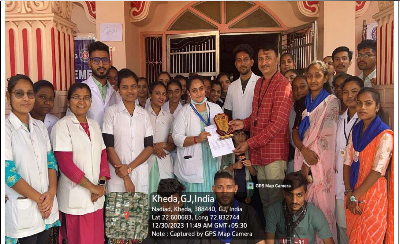
Health Check Up Camp