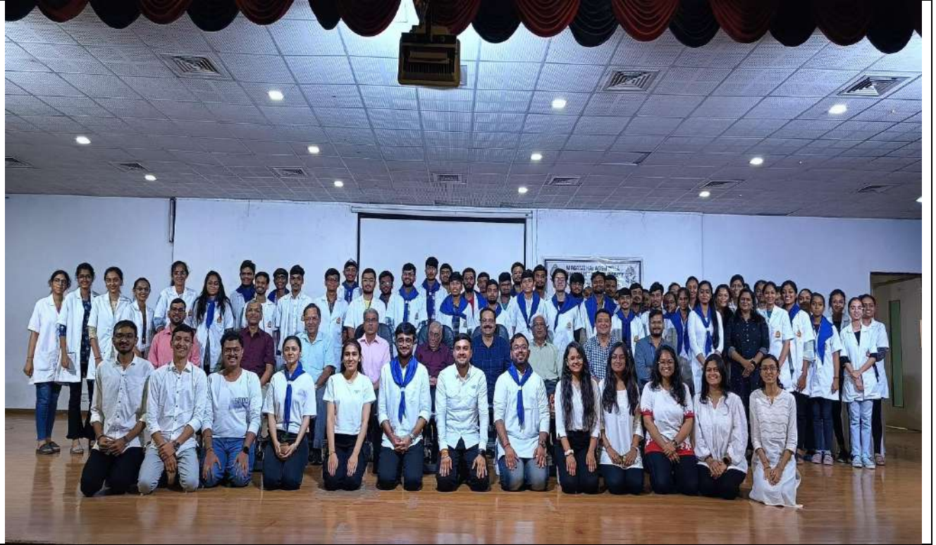
NSS Day Celebration