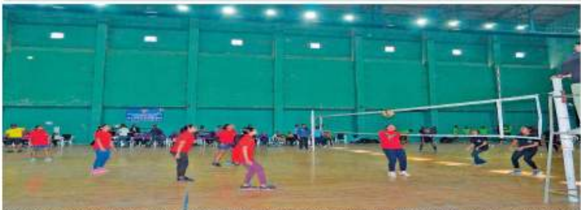
મહાગુજરાત મેડીકલ સોસાયટી સંચાલિત દિનશ પટેલ કોલેજ ઓફ ન સગ દ્વારા દિનશ પટેલ વોલીબોલ કપ ચિઝન-૨નું નડિયાદ સ્પોર્ટ કોમ્પ્લેક્સ ખાતે આયોજન કરવામાં આવ્યું હતું.

ન.િ. ખે સંચાલ નસિ કપ । કોમ્પ આણ દેનશ પુલકે મેડીક પટેલ મહા બેરમે આણ આયો ખેડા