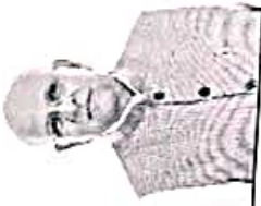
Shri Bhupendraabhai Patel Chief Minister, Gujarat

75 Azadi Ka Amrit Mahotsav Har Ghar Tiranga 13 th - 15 th August 2022