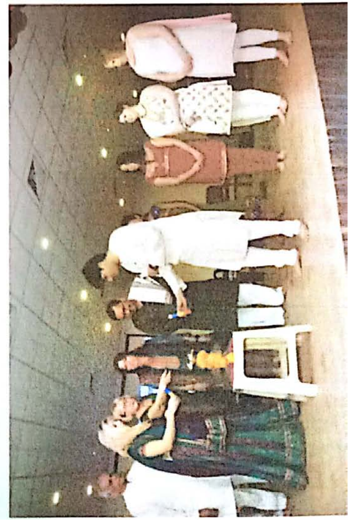
Scanned by CamScanner